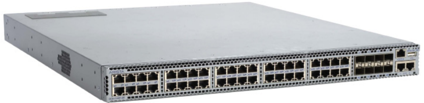
Arista 7140T-8S: 40-port 1/10GBASE-T (RJ-45) + 8 SFP+, 800 Gbps, 600 Mpps, L2/3/4

The Arista 7100T switches support 10GBASE-T over Category 6a and 7 cabling up to 100m, but also support Category 5e* and Category 6 cabling with distances up to 55m. This allows for investment protection with existing cabling plants.