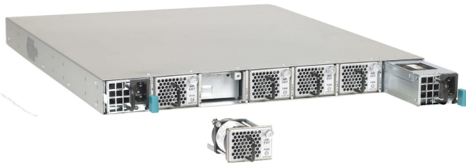
Arista 7100T rear view with two 1+1 redundant, hot-swappable power supplies and five N+1 redundant, hot-swappable independent fans.