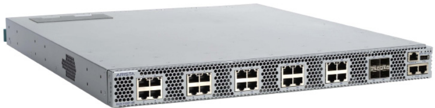
Arista 7120T-4S: 20-port 1/10GBASE-T (RJ-45) + 4 SFP+, 480 Gbps, 360 Mpps, L2/3/4