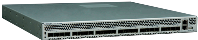
Arista 7124SX: 24-port 10GbE 480Gbps switch

The Arista 7124SX switch is a high performance, ultra-low latency layer 2/3/4 10 Gigabit Ethernet switch. Offered with 24 1/10GbE ports in a compact and power efficient 1RU chassis, the Arista 7124SX forwards packets in less than 500 nanoseconds. All ports accommodate the full range of 10GbE SFP+ and GbE SFP options, allowing for maximum flexibility and investment protection as customers of all sizes migrate their server connections from Gigabit to 10 Gigabit Ethernet. With Arista EOS, advanced monitoring and provisioning capabilities such as Latency Analyzer, Zero Touch Provisioning, VMTracer and Linux based tools can be run natively on the switch. A built in SSD is available for advanced logging, data captures and various services that can now be run from the switch.